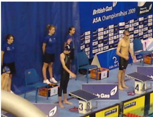
Waiting for the whistle...

I don't think about my competitors, I just think about my own race. As long as I have done a good PB, I have done my best. It is an achievement in itself to even make the nationals. I have already achieved the 14 year old national qualification times for the 200M IM and 400M IM for next years national. I have also been chosen by the ASA to go on a talent camp which will be divided into 3 separate days, and am really looking forward to it!"