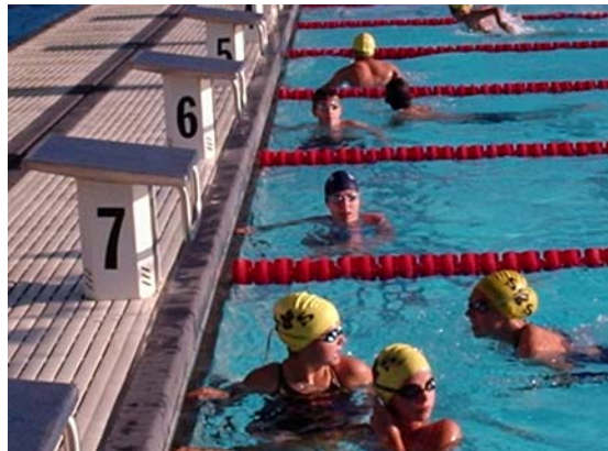
Spot the hat?

(Wouldn't it be interesting if some of our BSC swimmers found themselves competing against "Sharks" swimmers in 2012? - Ed).